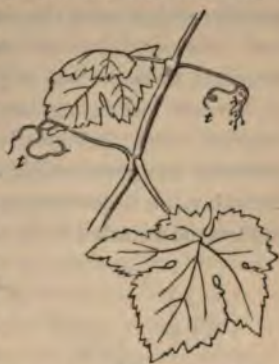
Fig. 8. TENDRIL OF A VINE.